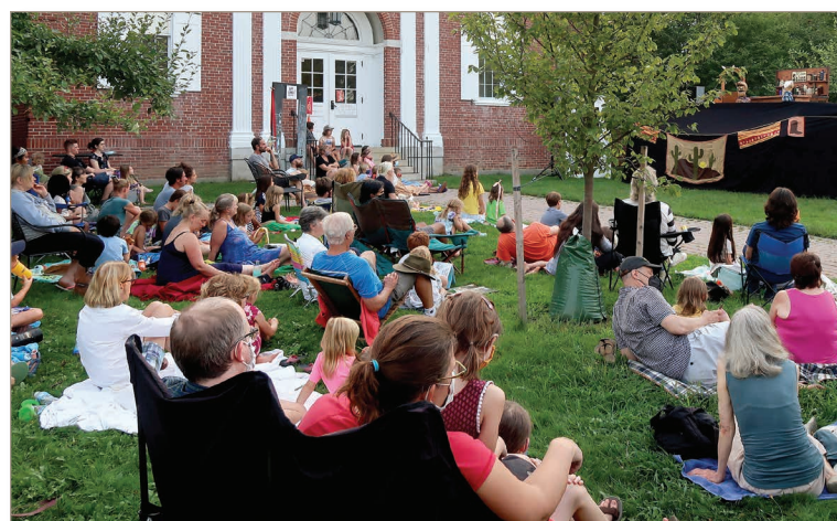
Frogtown Puppet Show

I am full of admiration for the way the Friends have creatively turned the challenges of the pandemic into ever-increased support for our great library, and we hope you will join us in this very satisfying endeavor. For information on how to help, please contact FOLvolunteers@bhpl.net , or inquire at the circulation desk. We look forward to having another successful year, and we thank you all very much for your continuing support. ☺