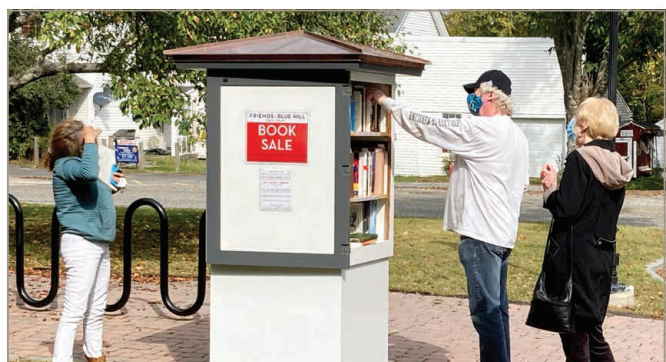
Our popular Fair Weather Kiosk

A huge thank you, Friends, because YOU make it all possible!