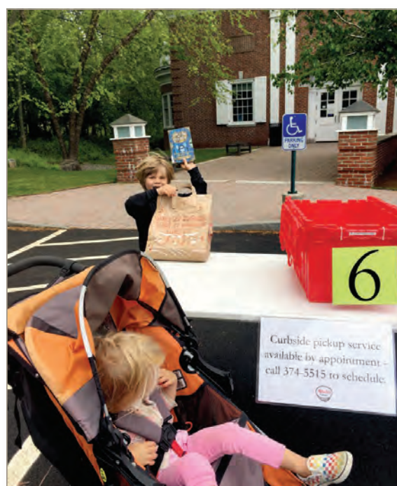
A mom sent us this photo of her kids getting their curbside pickup.