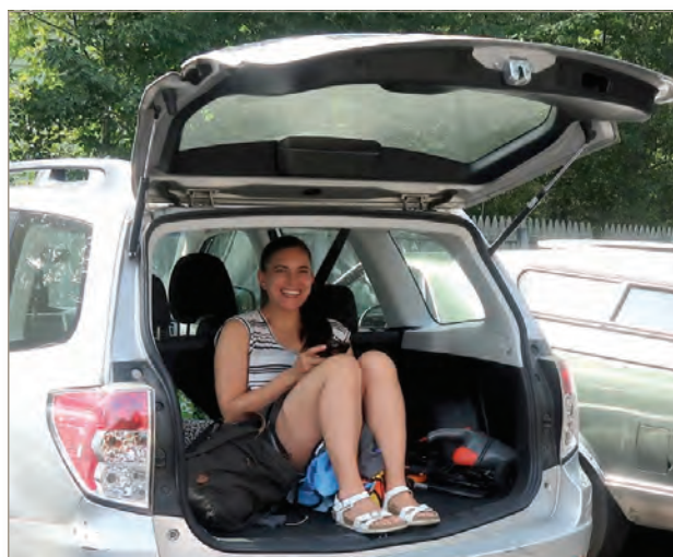
Patrons have been quite inventive in their office set-ups outside the Library while using Wi-Fi.

This quote was read to my second grade class in rural Wisconsin every week on Reading Wednesdays. For me, this was a glorious, unarguable opportunity to pull out the paperback I carried with me everywhere, and it’s not hard to imagine me as the girl on the playground with a book, not a ball, is it? Books were as promised—a gate to lands of pleasure, a friend. My family moved a lot and my home life was rocky to say the least, but books? Books were an escape