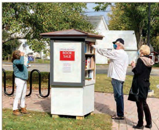
Our new and popular outdoor kiosk.

In addition, a new book kiosk has been installed on the library's front walkway. Until the true winter weather arrives, you can pick out new tomes for your collection while admiring the construction details: Bruce Stahnke donated the design; Phil Norris, Blue Hill's Tree Warden, contributed wood