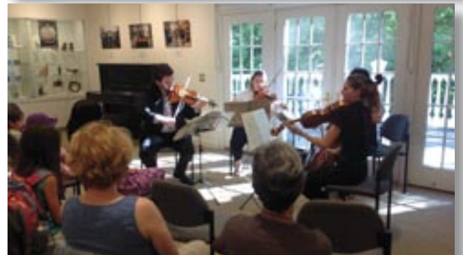
52 Weeks of Giving members create a story trail on Heritage Trust land (above), GSA workshop (above right) and a Kneisel Hall youth concert.