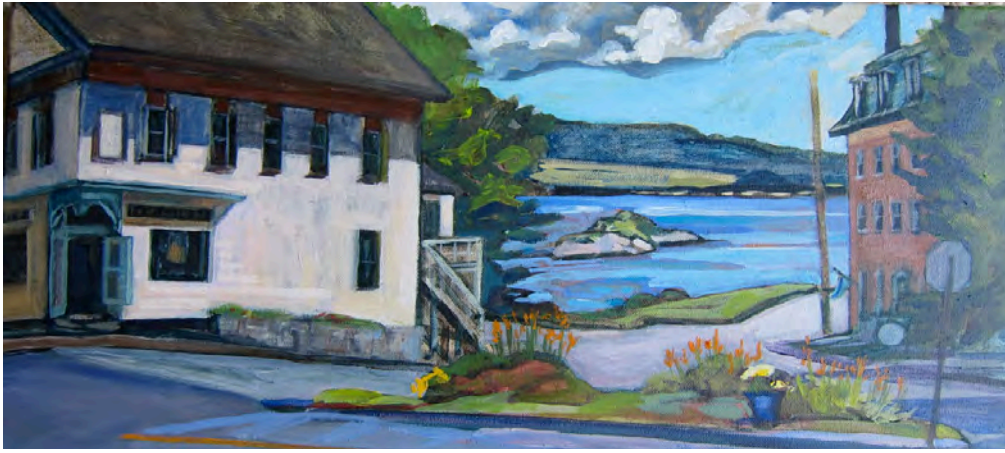
Painting detail from last year's Paint the Peninsula, "Blue Hill, 2012" by Annie Poole