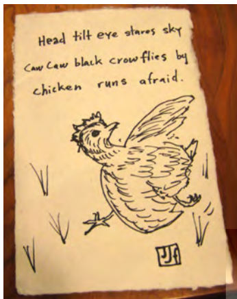
A Haiga created in a workshop led by Frederica Marshall