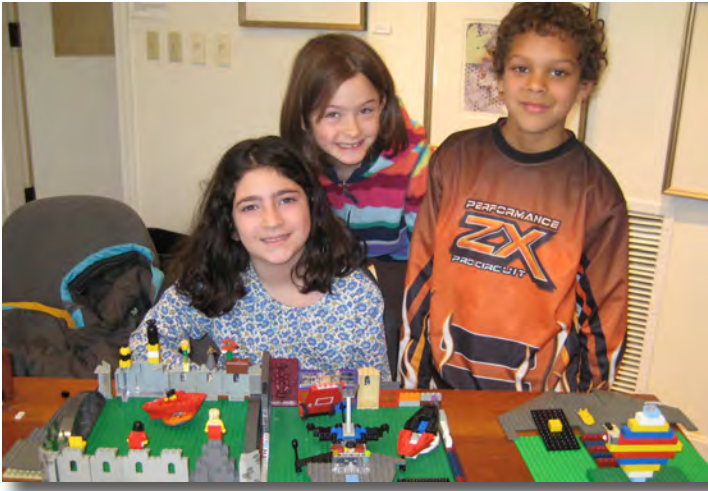
Lego club is a weekly children's offering during the school year, on Saturdays, from 10:30 to noon.