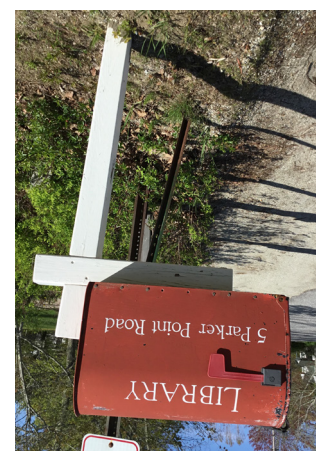
Blue Hill Public Library 5 Parker Point Rd. Blue Hill, Maine 04614

For questions and information about programs, services, and hours of operation, please visit our website, www.bhpl.net , or call us, 374-5515