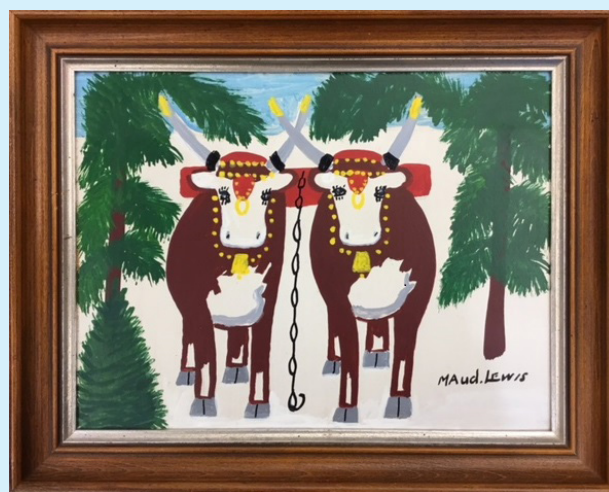
Two Oxen in Winter hangs in the Larchwood Room.

At age 34, Maud married the cantankerous local fish peddler Everett Lewis only a few weeks after she showed up on Lewis' doorstep, as the story goes, in response to an ad he had posted for a "live-in or keep house" companion. Everett owned the tiny, now-famous, one room cottage on the edge of Marshalltown where the couple lived for 32 years. Though the original intention was for Maud to do the house chores, Everett eventually took over these responsibilities so that Maud could paint. Maud's urge to paint was clearly a powerful force in their lives and Everett