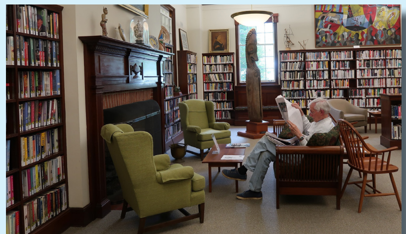
Catching up on the daily news will never go out of style at BHPL.

My struggle with Mein Kampf concluded with a most suitable outcome, as a very unsuitable book is no longer staring at me from my office bookshelves.