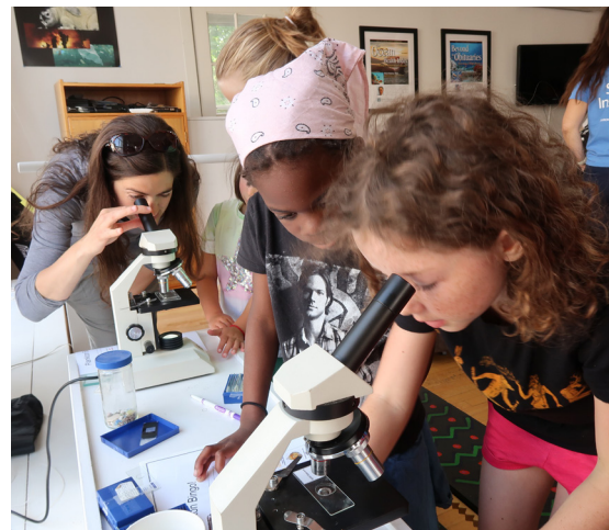
Program participants at the Shaw Institute lab facilities.