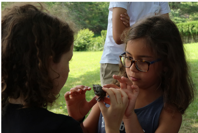
Kids investigating a green crab.