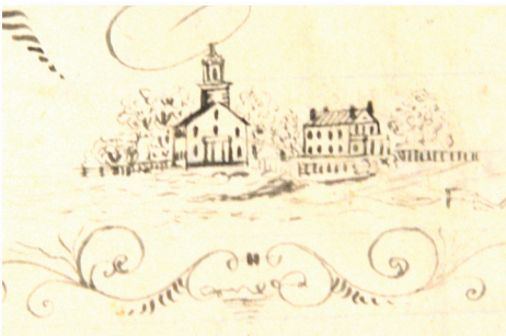
Blue Hill Academy journal from 1868 (left) and a detail from an academy newspaper. (above)