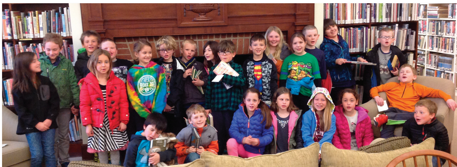
An annual library tradition: Blue Hill second graders visit BHPL to get their first library cards.