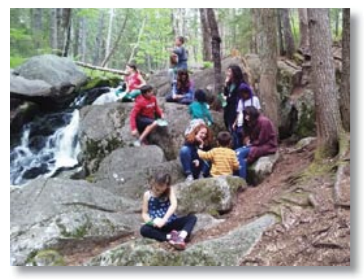
52 Weeks of Giving members create a story trail on Heritage Trust land (above), GSA workshop (above right) and a Kneisel Hall youth concert.

As the novelty of being new wears off and we settle into our lives here, we continue to be amazed by how this community takes care of one another. And, while we'll likely always miss the sound of rain on a tin roof, we are now blessed with sunlight sparkling on the sea, and girls rushing in giddy after coming face to face with a moose. So when I look at that pile of good things and bad things that is my life, Blue Hill is definitely one of the good things. One of the very best.