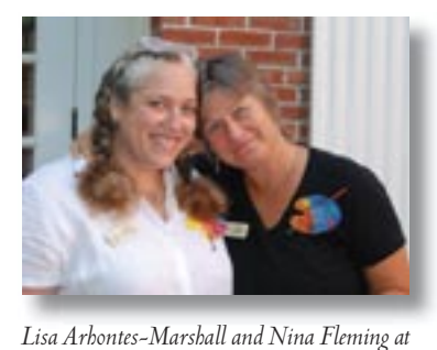
Paint the Peninsula

The Blue Hill Public Library opens doors to information, culture, community and the world. ~-BHPL mission statement