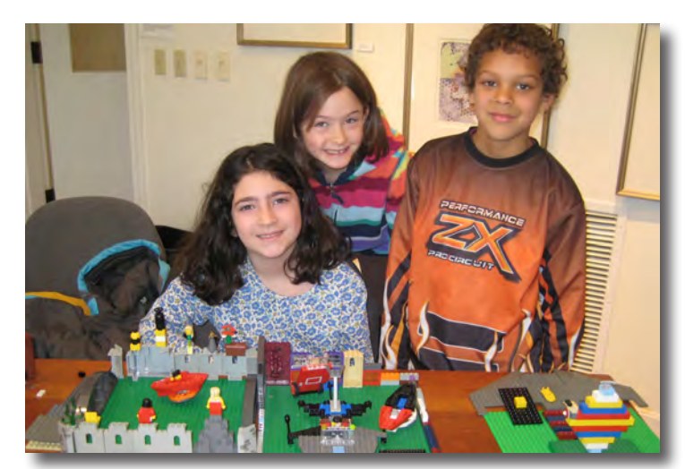
Lego club is a weekly children's offering during the school year, on Saturdays, from 10:30 to noon.