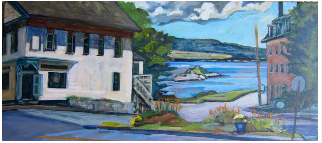
Painting detail from last year's Paint the Peninsula, "Blue Hill, 2012" by Annie Poole